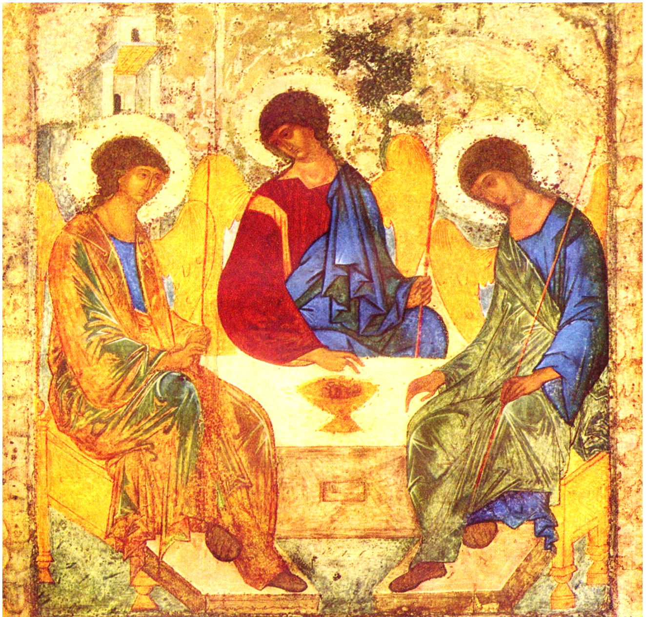
The Holy Trinity (1411) by Andrei Rublev

HOLY EUCHARIST: RITE TWO MAY 31, 2026 | 10:00 AM