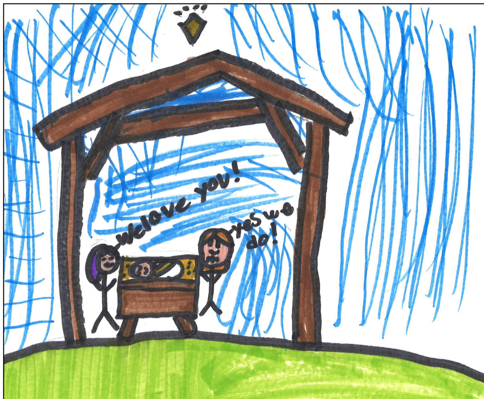
BEST STORYTELLING: MYSTERY SUBMISSION